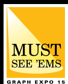
Grand Format Estimating

Director Arizona State University Print & Imaging Laboratory